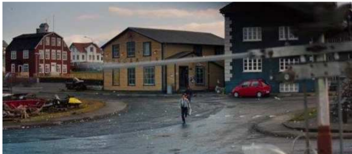
In the movie

It was here, that we learned, that all scenes from the movie „The Secret Life of Walter Mitty“ supposedly playing in Greenland were actually filmed in Iceland. A shop at the harbour of Stykkisholmur was `playing` the bar in „Greenland“. From that bar, Ben Stiller went to board the helicopter. Of course we wanted to find “the bar”.